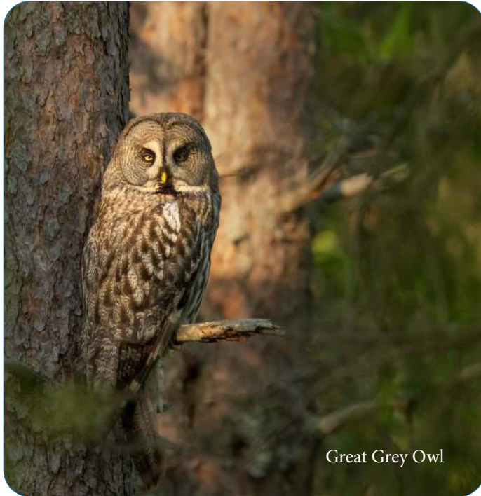
Great Grey Owl