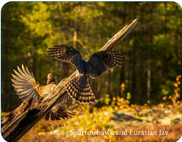
Sparrowhawk and Eurasian Jay

Departure from the hide takes place at dusk, around 19:00. We return to Villa Finnature for dinner and accommodation, with time in the evening to recharge batteries and empty memory cards.