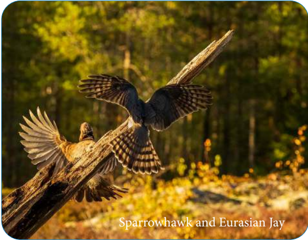
Sparrowhawk and Eurasian Jay

Departure from the hide takes place at dusk around 19:00. Drive back to Villa Finnature for dinner and accommodation. Good time to charge batteries and empty memory cards in the evening.