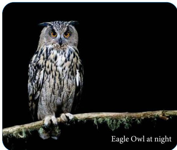
Eagle Owl at night

After the late breakfast at Villa Finnature the tour will end at Oulu Airport at noon.