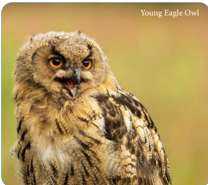
Young Eagle Owl

We have a special LED light system for the Eagle Owl. So no need for flashes even at night.