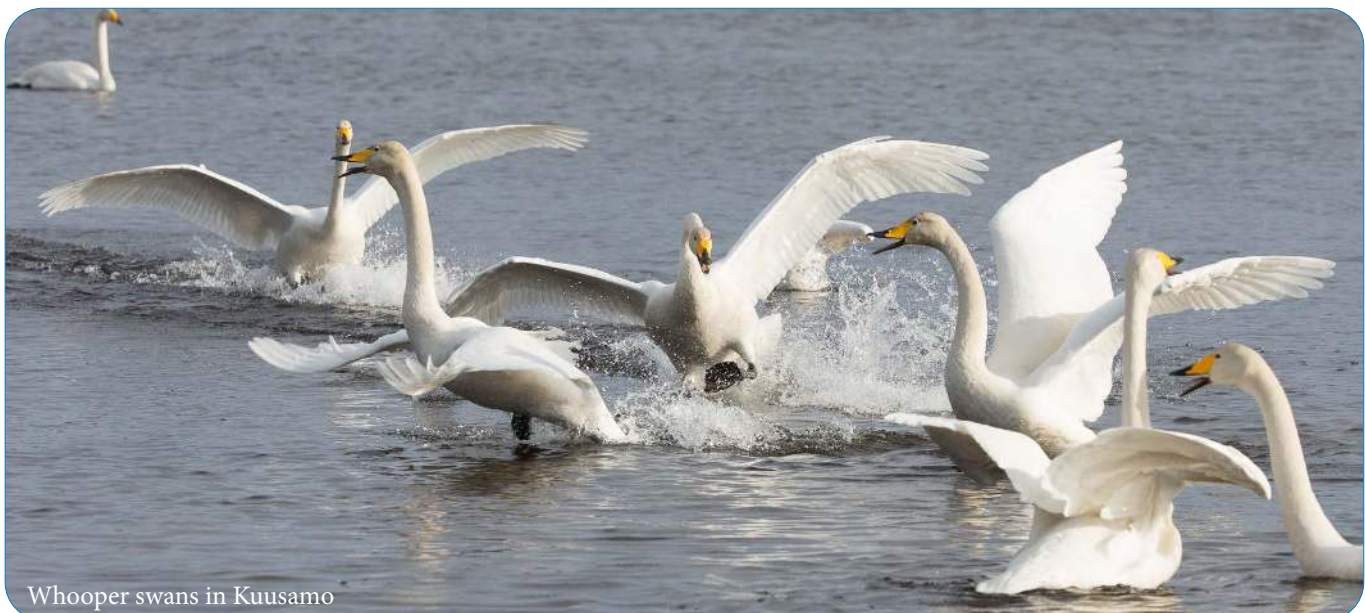
Whooper swans in Kuusamo

This morning we sleep a little longer. After 7.00 breakfast, we head to the morning photography session at the small birds feeder, where there are tens of Bullfinches, Bramblings and many other birds actively visiting the feeder. After the photo session, return to accommodation for early dinner at 15.00. After dinner we head to the barn hide, where we photograph Common Cranes and Taiga Bean Geese at the field during their migration