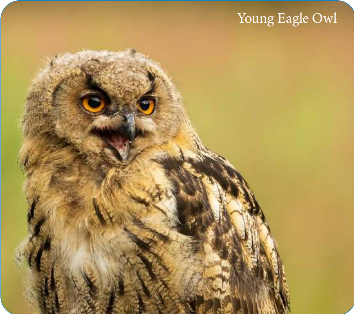
Young Eagle Owl

We have a special LED light system for the Eagle Owl. So no need for flashes even at night.