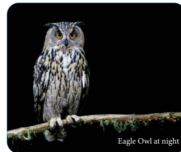
Eagle Owl at night

After the late breakfast at Villa Finnature the tour will end at Oulu Airport at noon.