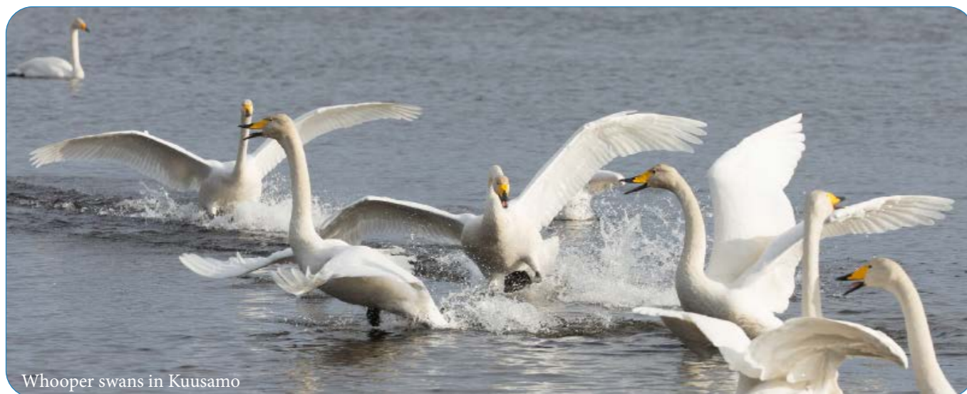
Whooper swans in Kuusamo

Before dawn, we are ready in our hides for the Capercaillie lek. When the lek is over between 9.00 - 10.00, we return to our accommodation for breakfast. After early dinner we head once again to the Whooper Swan, Common Crane, White-tailed Eagle and waterfowl from the shore hides by a lake.