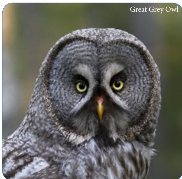
Great Grey Owl

Recommended flights: We recommend to arrive to and depart from Kuusamo around midday.