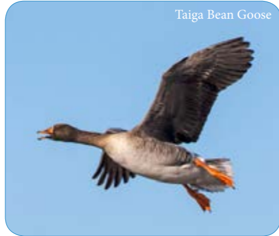
Taiga Bean Goose