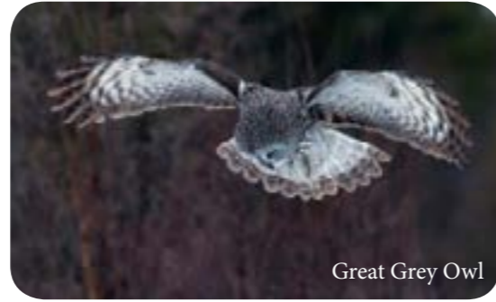
Great Grey Owl

After early morning photography session in Oulu we might leave to Kuusamo early, depending on a bird situation. In Kuusamo we spend the evening with photogenic Whooper Swans. Kuusamo is our base for the next three nights.