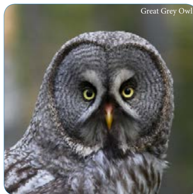
Great Grey Owl

Please notice: The itinerary might change due to weather conditions or bird situation. Unfortunately we cannot guarantee any of the species, but our expert Finnature guides do their utmost to ensure the best possible photography opportunities during the tour.